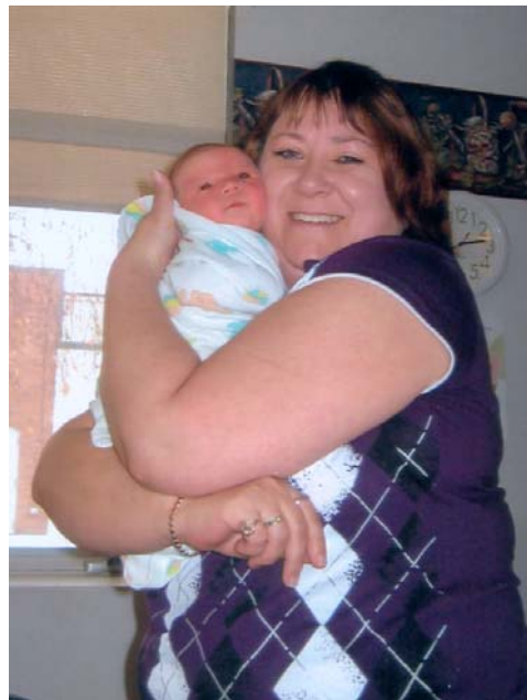
"You are perfect to me, no matter what others may see."