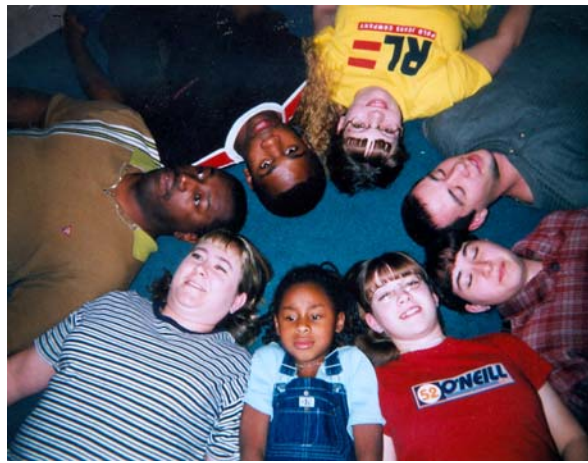
"I love you in the morning, and in the afternoon, I love you in the evening and underneath the moon."