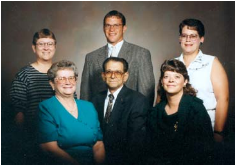
"I Love You!"