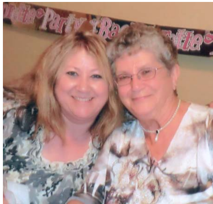
"If you aint 1st ya last"