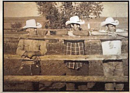
Close the Gate (For Dad)